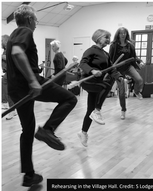
Rehearsing in the Village Hall.