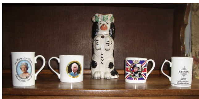
David's ever-growing mug collection with its latest addition.