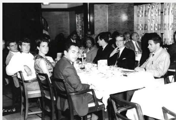
Photographed on board R.M.S. QUEEN ELIZABETH.